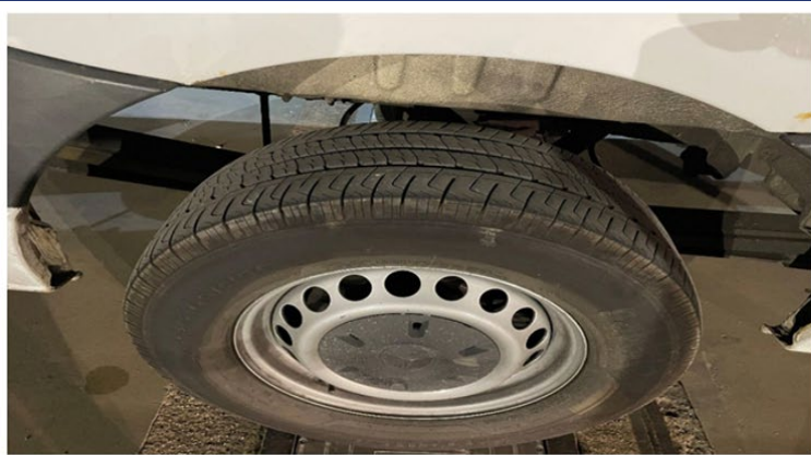
Example of a modified suspension fitted to a Mercedes Sprinter vehicle 3.5 tonne vehicle – uprated springs fitted (eg. those normally fitted to 7.5 tonne vehicles).