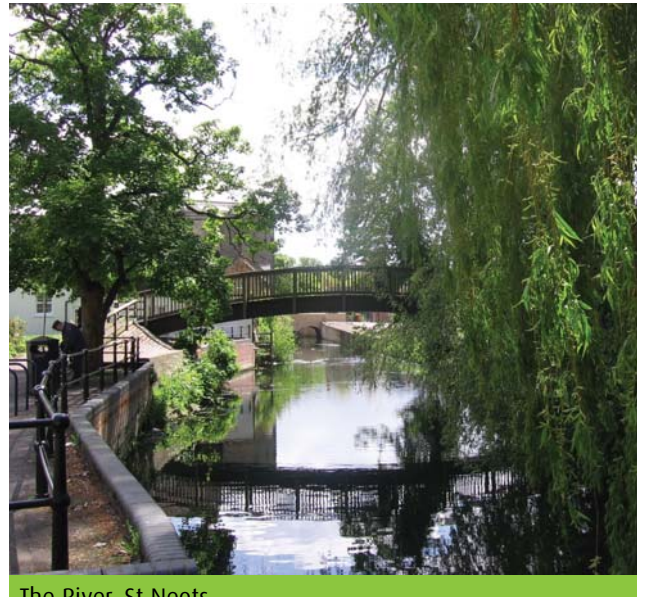
The River, St Neots