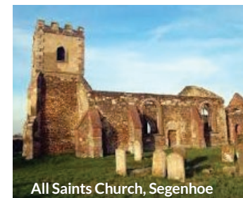
All Saints Church, Segenhoe

At point 18 you are close to the remains of All Saints Church, Segenhoe, which dates to the 12 th century but has been unused since 1927. This is fully accessible (on foot!) so why not come back and explore?